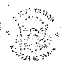
EXHIBIT 10 MAY 19 1964 U.S. DEPARTMENT OF JUSTICE

Main body of faint, illegible text, appearing to be several paragraphs of a letter or report.